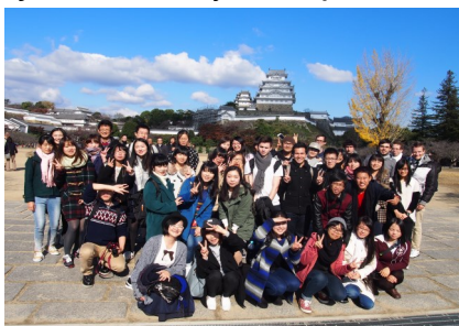
Group picture in front of Himeji castle

39 international students from 12 different countries, 2 Japanese students, and 2 staff from IER went to Himeji for a one day bus trip. It was a beautiful day and Himeji castle looked gorgeous against the blue sky. We headed to Shoshazan after-