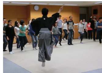
Students are mimicking the masters' movement to express deafening thunder.

Zenchiku Society for your great kindness and time you so thoughtfully took out for us from your busy schedule.