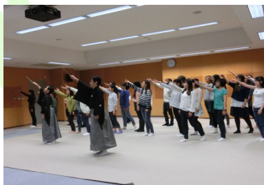
Students are repeating after two masters for vocal training