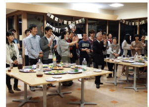
Volunteers and Japanese students were both raising spirit of the reception.