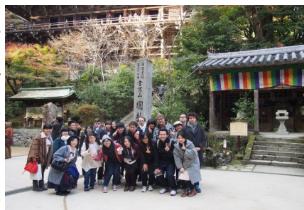
At Maniden, Shoshazan Engyo-ji

ward and took a ropeway up to Engyo-ji. The international students seemed to be interested in the colored leaves and bodhisattva statues. They took many pictures and read descriptions on their own. The trip was full of laughter and fun.